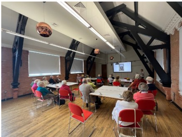
Listening to a talk at the Richard III Visitor Centre

enter Leicester Cathedral due to ongoing restoration and renewal efforts, the Friends were treated to a private 30-minute talk in the Kings Suite on The Cathedral Church of Saint Martin, commonly known as Leicester Cathedral. The decision to renovate Leicester Cathedral stems from the need to enhance its flexibility and address inadequacies in its current spaces, driven by a tenfold increase in visitors, drawn particularly to witness the tomb of King Richard III. Our talk provided a unique insight into the challenges and aspirations driving the Cathedral's transformation, leaving us with a profound appreciation for the historical and cultural tapestry woven into its stones.