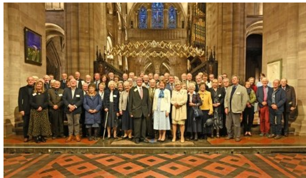
Delegates to the Friends' Conference, Hereford

As always, much of the value of the conference was the opportunity to talk informally at its edges to discover how others were working and developing (or not!). Existing friendships cemented and deepened and new friendships initiated were the greatest benefit. I was encouraged that Tewkesbury seems to be among those Friends' organisations being well-